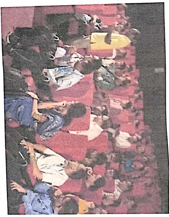
Audience in the event